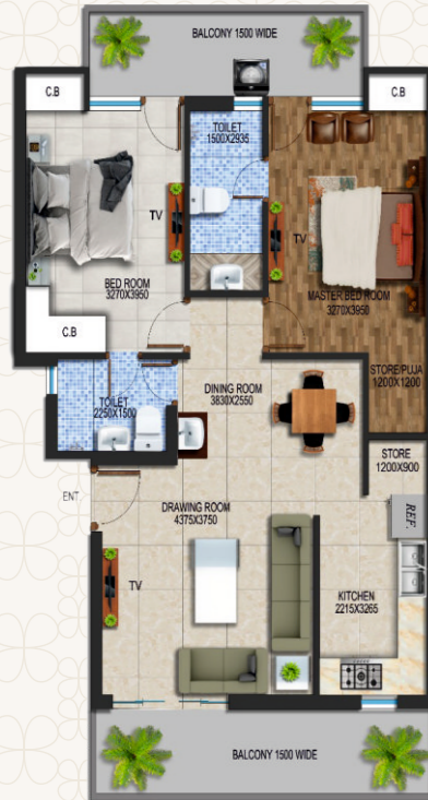
2 BHK Unit Super Area 1150 sqft.