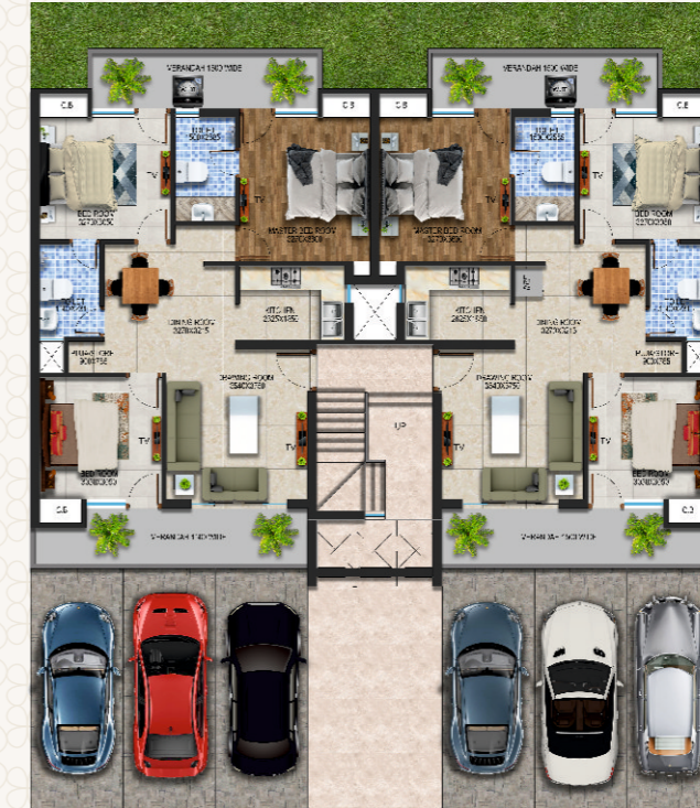
Ground Floor Plot Area 386 sq. yard