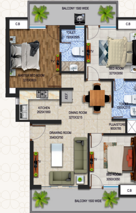
3 BHK Unit Super Area 1350 sqft.