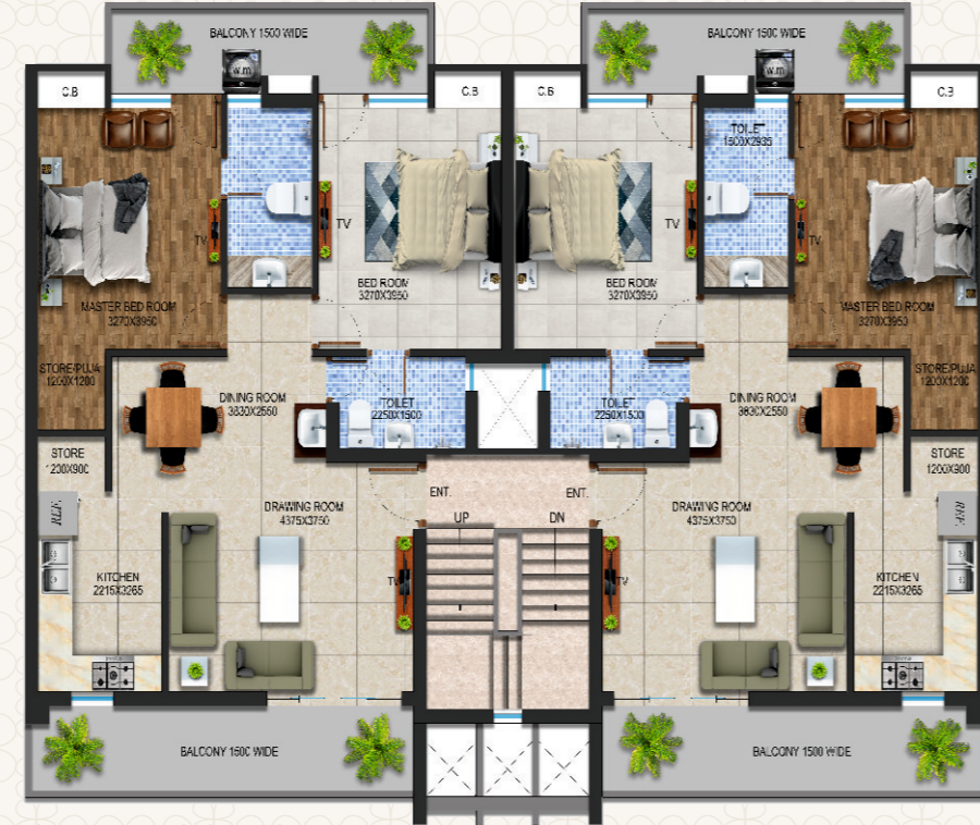
First & Second Floor Plan