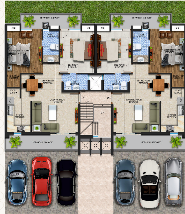
Ground Floor Plot Area 386 sq. yard