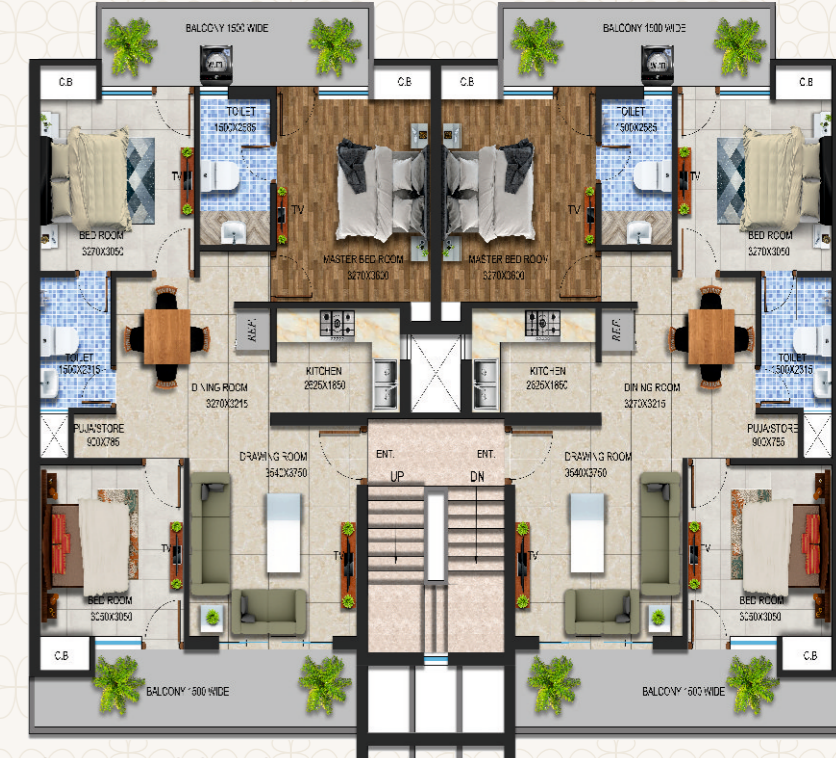
First & Second Floor Plan